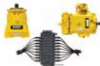
Pumps, valves, and motors